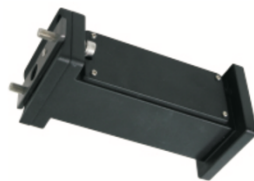
6" Arm Bracket Mount