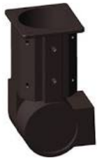
Slip Fit Mount